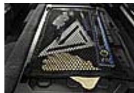
Seat Back Cargo Net $64.00 Installed MSRP*