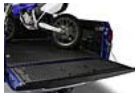
Bedliner w/Deck Rails Short/Regular Bed $345.00 Long Bed $375.00 Installed MSRP*