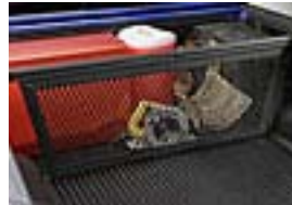
Cargo Divider $330.00 Installed MSRP*