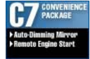
C7 Convenience Package ▶ Auto-Dimming Mirror ▶ Remote Engine Start $809.00 Installed MSRP*