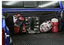
Cargo Net Exterior $49.00 Installed MSRP*