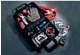
Emergency Assistance Kit $70.00 Installed MSRP*