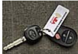
Remote Engine Start $529.00 Installed MSRP*