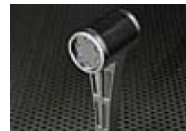
Anodized Aluminum Shift Knob $85.00 Installed MSRP*