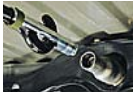
Spare Tire Lock $73.00 Installed MSRP*