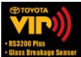
VIP Security Systems RS3200 Plus $299.00 Installed MSRP* Glass Breakage Sensor $165.00 Installed MSRP*