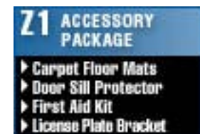
Z1 Accessory Package ▶ Carpet Floor Mats ▶ Door Sill Protector ▶ First Aid Kit ▶ License Plate Bracket Z1 Preferred Accessory Package Regular Cab $153.00 Double Cab $220.00 CrewMax $233.00 Installed MSRP*

© 2007 Toyota Motor Sales, U.S.A., Inc. Produced 10.15.07