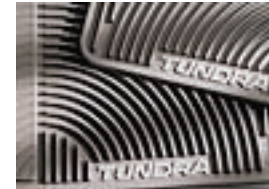
All Weather Mats and Door Sill Protector Regular Cab $94.00 Double Cab $162.00 CrewMax $214.00 Installed MSRP*