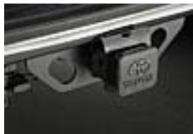
Tow Hitch w/Wire Harness $820.00 w/o Wire Harness $485.00 Installed MSRP*