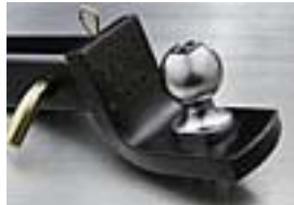
Ball Mounts $29.00 Parts Only MSRP**