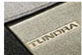
Carpet Floor Mats w/Door Sill Protector Regular Cab $111.00 Double Cab $178.00 CrewMax $181.00 Installed MSRP*