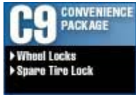
Convenience Package $152.00 Installed MSRP*

These exterior accessories are also available: • License Plate Frame Bracket