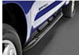
Tube Steps Chrome $519.00 Black $475.00 Installed MSRP*