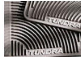
All Weather Mats Regular Cab $55.00 Double/CrewMax $99.00 Installed MSRP*