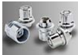
Wheel Locks $79.00 Installed MSRP*