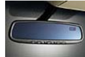
Auto Dimming Mirror $280.00 Installed MSRP*