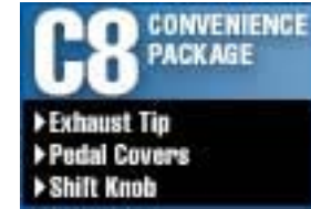
C8 Convenience Package ▶ Exhaust Tip ▶ Pedal Covers ▶ Shift Knob C8 Convenience Package 4.7L $239.00 5.7L $249.00 Installed MSRP*