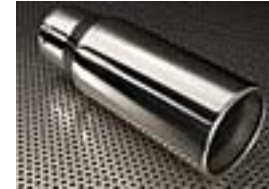
Exhaust Tip 4.7L $69.00 5.7L $79.00 Installed MSRP*