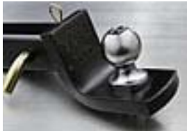
Ball Mounts $29.00 Parts Only MSRP**