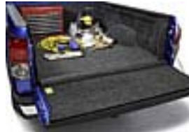
Bed Rug Short Bed $409.00 Regular Bed $419.00 Long Bed $434.00 Parts Only MSRP**