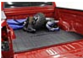
Bed Mat Short/Regular Bed $127.00 Long Bed $137.00 Installed MSRP*