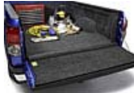
Bed Rug Short Bed $409.00 Regular Bed $419.00 Long Bed $434.00 Parts Only MSRP**