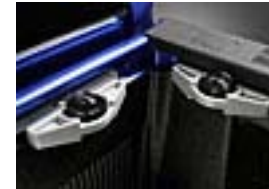
Deck Rail Systems w/4 Cleats Short/Regular Bed $210.00 Long Bed $220.00 Installed MSRP*