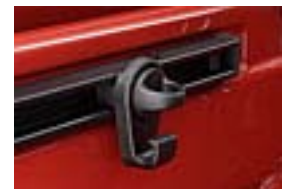
Mini Tie Down w/Hook (set of two) $45.00 Installed MSRP*