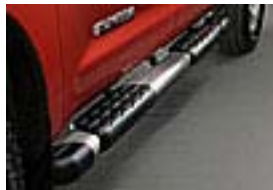
Stepboards Brushed Stainless Steel Regular Cab $475.00 Double Cab $589.00 CrewMax $589.00 Installed MSRP*