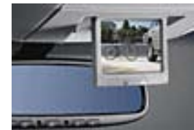
Back-Up Camera w/Monitor $695.00 Installed MSRP*