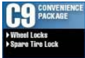
Convenience Package $152.00 Installed MSRP*

These exterior accessories are also available: • License Plate Frame Bracket