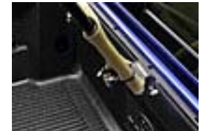
Locking Bike Fork Attachment $95.00 Installed MSRP*