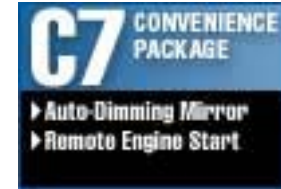
C7 Convenience Package ▶ Auto-Dimming Mirror ▶ Remote Engine Start $809.00 Installed MSRP*