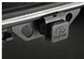
Tow Hitch w/Wire Harness $820.00 w/o Wire Harness $485.00 Installed MSRP*