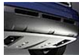
Front Skid Plate $425.00 Installed MSRP*