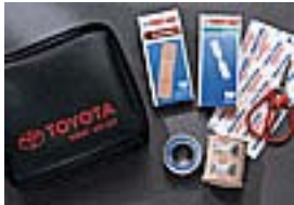
First Aid Kit $29.00 Installed MSRP*