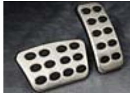
Sport Pedal Stainless Steel $85.00 Installed MSRP*