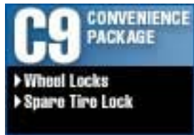
Convenience Package $152.00 Installed MSRP*

These exterior accessories are also available: • License Plate Frame Bracket