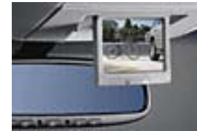
Back-Up Camera w/Monitor $695.00 Installed MSRP*