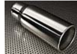
Exhaust Tip 4.7L $69.00 5.7L $79.00 Installed MSRP*