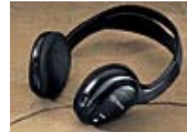
Wireless Headphones $82.00 Installed MSRP*