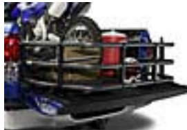
Bed Extender $320.00 Installed MSRP*