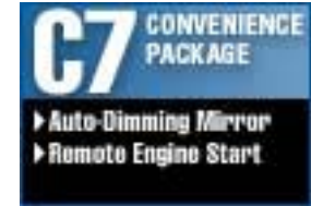
C7 Convenience Package ▶ Auto-Dimming Mirror ▶ Remote Engine Start $809.00 Installed MSRP*