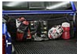
Cargo Net Exterior $49.00 Installed MSRP*