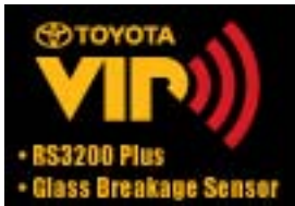
VIP Security Systems RS3200 Plus $299.00 Installed MSRP* Glass Breakage Sensor $165.00 Installed MSRP*