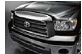
Hood Protector $165.00 Installed MSRP*