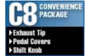
C8 Convenience Package ▶ Exhaust Tip ▶ Pedal Covers ▶ Shift Knob C8 Convenience Package 4.7L $239.00 5.7L $249.00 Installed MSRP*