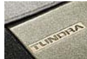
Carpet Floor Mats w/Door Sill Protector Regular Cab $111.00 Double Cab $178.00 CrewMax $181.00 Installed MSRP*

© 2007 Toyota Motor Sales, U.S.A., Inc. Produced 10.15.07