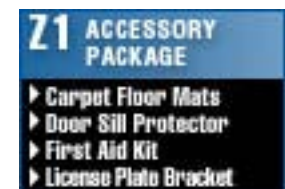
Z1 Accessory Package ▶ Carpet Floor Mats ▶ Door Sill Protector ▶ First Aid Kit ▶ License Plate Bracket Z1 Preferred Accessory Package Regular Cab $153.00 Double Cab $220.00 CrewMax $233.00 Installed MSRP*