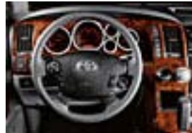
Molded Dash Applique by Superior Dash Regular Cab $340.00 Double/CrewMax $350.00 Installed MSRP*