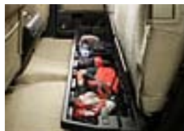
Underseat Storage $125.00 Installed MSRP*