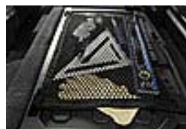
Seat Back Cargo Net $64.00 Installed MSRP*