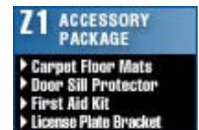
Z1 Accessory Package ▶ Carpet Floor Mats ▶ Door Sill Protector ▶ First Aid Kit ▶ License Plate Bracket Z1 Preferred Accessory Package Regular Cab $153.00 Double Cab $220.00 CrewMax $233.00 Installed MSRP*