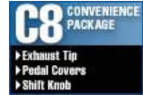
C8 Convenience Package ▶ Exhaust Tip ▶ Pedal Covers ▶ Shift Knob C8 Convenience Package 4.7L $239.00 5.7L $249.00 Installed MSRP*