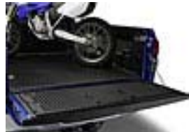
Bedliner w/o Deck Rails Short/Regular Bed $325.00 Long Bed $355.00 Installed MSRP*