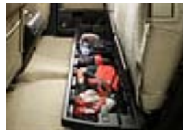
Underseat Storage $125.00 Installed MSRP*