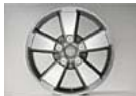
Carve 20" Alloy Wheel $2,200.00 Installed MSRP*