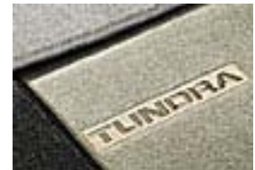
Carpet Floor Mats w/Door Sill Protector Regular Cab $111.00 Double Cab $178.00 CrewMax $181.00 Installed MSRP*