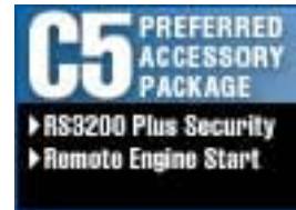
C5 Preferred Accessory Package ▶ RS3200 Plus Security ▶ Remote Engine Start $828.00 Installed MSRP*