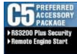
C5 Preferred Accessory Package ▶ RS3200 Plus Security ▶ Remote Engine Start $828.00 Installed MSRP*