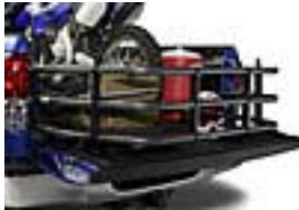
Bed Extender $320.00 Installed MSRP*